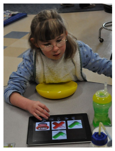
Using an IPAD for choice and communication.