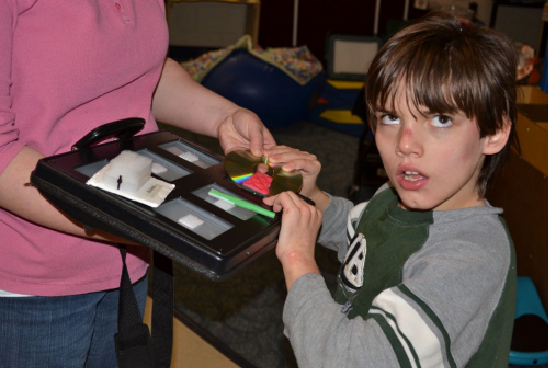
Student using object choice board

The purpose of a newsletter is to provide educators (both general and special education) in Lapeer County information on the latest assistive technology devices, strategies, or evaluation techniques to use with students at risk or with disabilities.